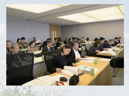
2nd Steering Committee Meeting