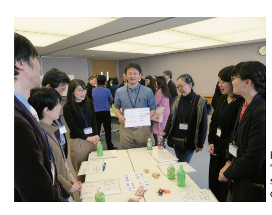
Parcitpants show their "introduce yourself" sheets and meet each other