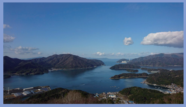
View of the Maizuru Bay

With the theme "Museums as Cultural Hubs: the Future of Tradition", the ICOM Kyoto 2019 General Conference aims to provide a forum on 30th SEPTEMBER 2018 at Maizuru. The aim is to consider how museums can be hubs to create a richer future whilst respecting the traditions of the past. At the Maizuru Meeting with one year before the ICOM Kyoto 2019, we would like to welcome research and case studies on this subject, and we hope to pioneer the debate at ICOM Kyoto 2019. This meeting will be a conference open to the public.