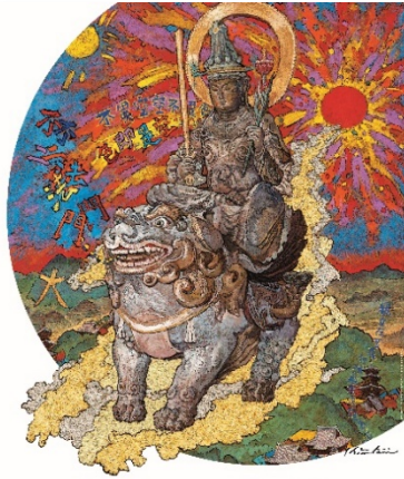
Official Poster of ICOM Kyoto 2019

This uplifting trip for art lovers will take you into museums on the high floors of two landmark buildings of Osaka: Umeda Sky Building, which was selected as one of the top 20 architectural structures in the world in 2008 by a UK newspaper, The Times , and the Abeno Harukas, Japan's highest building. In the Koji Kinutani Tenku Art Museum, the world premier 3D image experiences invite visitors to the Kinutani's works. You may meet the celebrated artist Mr. Kinutani himself - who created his painting for the poster of ICOM Kyoto 2019.*