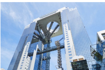
Umeda Sky Building

Harukas 300 Observatory: The observatory occupies the 58th to 60th floors of Abeno Harukas, renowned as the highest skyscraper in Japan. The glass-enclosed observation deck on the 60th floor is about 140 m in circumference and 300 m high above the ground, and commands panoramic views of the entire Osaka plain.