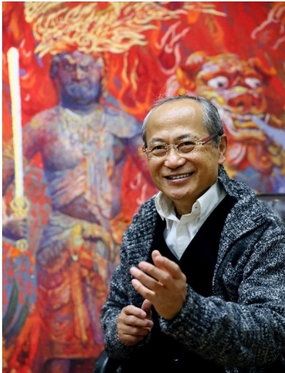
Mr. Koji Kinutani