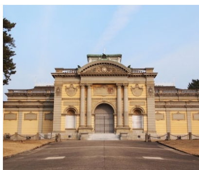
Nara National Museum