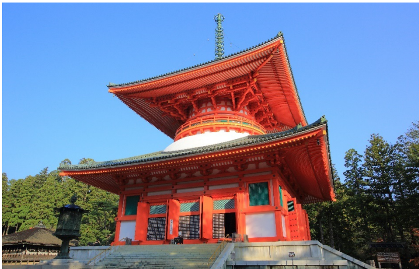
Danjo-garan temple complex

Travel deep into the southern Kii mountain ranges to the clear air and contemplative atmosphere of one of Japan's most sacred sites, the spectacular mountain of Koyasan. This cultural landscape includes more than a hundred intricately crafted buildings, statues and mandala all belonging to the Shingon-sect of esoteric Buddhism. We will visit the Danjo-garan temple complex and the Okuno-in cemetery, two of the area's most important sites. Try the traditional vegetarian cuisine of the monks, carefully cultivated and prepared in the mountains, and designed to celebrate and elevate simple ingredients into a meal harmoniously interwoven with nature.