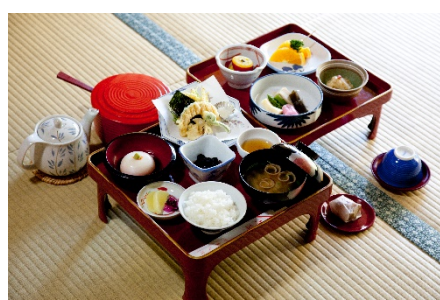
Buddhist vegetarian cuisine