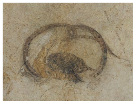
Kitora Burial Mound North Wall Mural, Black Turtle