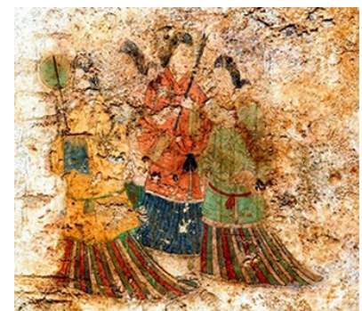
Takamatsuzuka Tombs West Wall Mural