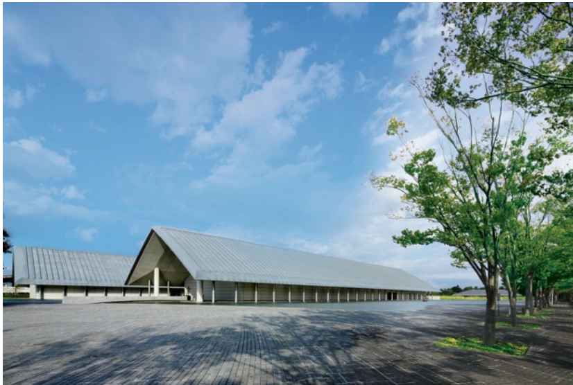
Sagawa Art Museum

Sagawa Art Museum is situated amongst the stunning natural surroundings of the Omi-Moriyama area. Amongst the museum's exquisite collection are many masterpieces of the Japanese art. We will have an exclusive tour of the modern tea room designed by the ceramic artist Raku Kichizaemon XV. After enjoying the local delicacy of Omi beef sukiyaki for lunch, we will spend the afternoon exploring the scenic streets of Omihachiman, which came to prominence as a historic center of commerce, and visit the Himure Hachiman Shrine.