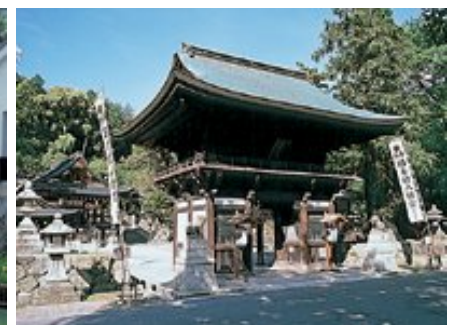
Himure Hachimangu Shrine