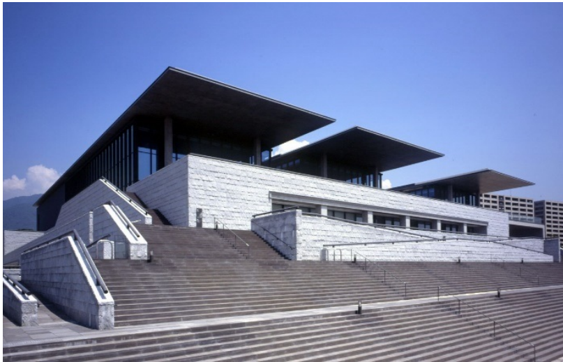
Hyogo Prefectural Museum of Art

A must for lovers of contemporary architecture is this visit to Hyogo Prefecture's two buildings designed by world-renowned architects, Tadao Ando: Hyogo Prefectural Museum of Art and Hiroshi Sanbuchi: Rokko Shidare Observatory. At the museum, we will see the special exhibition of the Yamamura Collection centering on the works of artists of the GUTAI group, who are gaining international attention, and the Ando Gallery, which was added to the museum in May 2019. From the observatory on the top of Mt. Rokko, you will enjoy a panoramic view of Kobe City and Osaka Bay.