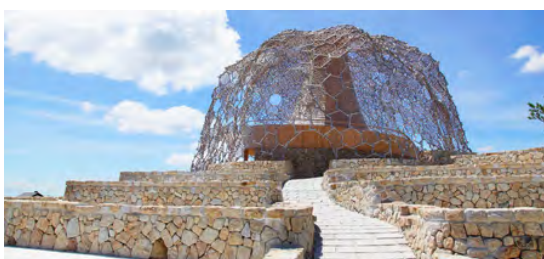
Rokko Shidare Observatory

Rokko Shidare Observatory: Perched on the Rokko Mountain in Kobe, the Observatory is a unique landmark that not only takes in spectacular views, but also provides a place to experience the natural energy and beauty of the Rokko Mountain. The observatory was designed by the famous architect, Hiroshi Sanbuchi, with the image of a large tree standing on the Rokko Mountain.