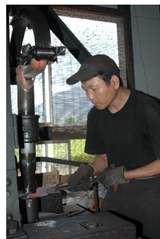
Takefu Knife Village