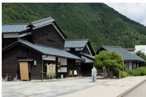
Echizen Paper Village

Takefu Knife Village: Looking forward and back, the craftspeople in Takefu will demonstrate the traditional skills of knife making, and their contemporary designs and inspiration.