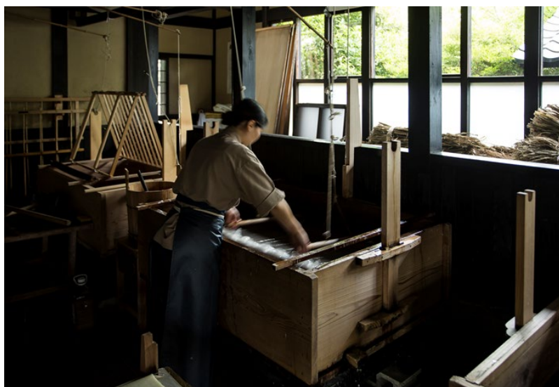
Echizen Paper Making Experience

Fukui Prefecture is one of the few areas of Japan where many artisans with the finest craftsmanship are still producing various traditional handmade goods. This tour will visit factories of Echizen washi Japanese paper, Echizen forged blades, and Echizen lacquerware, which are all designated as traditional craftworks, to learn about traditional techniques passed down through generations and the master craftsmanship of artisans. You are invited to have a go at making washi paper at the Echizen Washi Village, and enjoy a factory tour and shopping at the Echizen Lacquerware Hall and Takefu Knife Village.