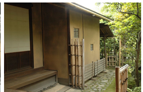
Taian tea arbor in Myokian temple