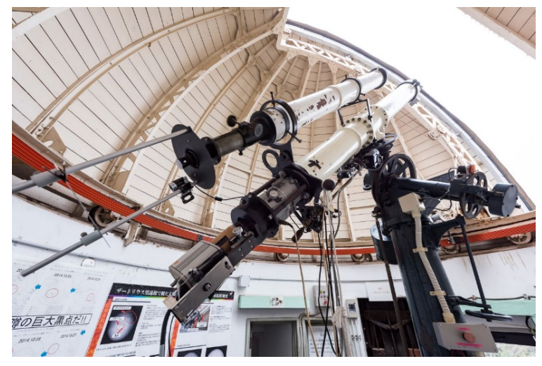
"Sartorius 18cm Refractive Telescope," Japan's oldest telescope that is still used for scientific research

Kwasan Observatory: This astronomical observatory, is nicknamed the "The Home of Amateur Astronomy" as it is considered to be the foundation of modern astronomy in Japan today. Inside the Main Building equipped with a dome spanning 9m diameter, it has a 45-cm-diameter telescope—the third-largest refracting telescope in Japan. You can also visit the history museum and other places that display observation materials and items of interest. It is usually private and only accessed for academic purposes, but is being opened especially for ICOM Kyoto 2019 participants.