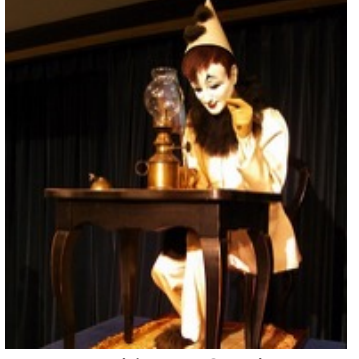
Kyoto Arashiyama Orgel Museum