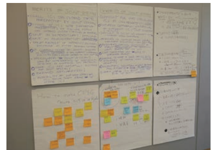
Group Discussions (top and center); Presenting the results of group work (bottom)