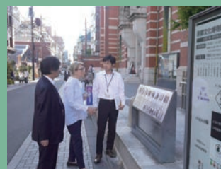
The Museum of Kyoto