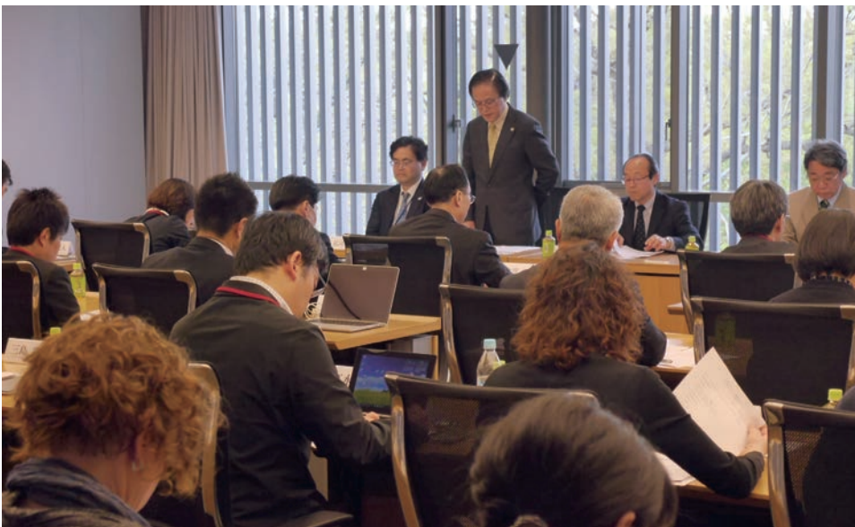
First Meeting of the Steering Committee at the Kyoto National Museum

The first meeting of Steering Committee was held at the Kyoto National Museum on 18th April 2017. Formed under the directive of ICOM Kyoto 2019 Organizing Committee to lead practical preparations for the General Conference (GC), it is comprised of 47 members, representing heads of each of ICOM's International Committees, as well as representatives from local business, government, and museums in Kyoto.