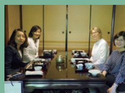
Enjoying Japanese food culture at the traditional house