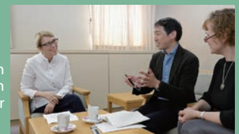
Interview with Kyoto Shimbun Newspaper