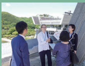
Kyoto International Conference Center (main venue)

During their staying in Kyoto, ICOM delegates visited venues for the main conference and offsite meetings, including several cultural facilities