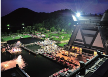
Image of Welcome Reception (top), Exhibition hall (bottom-left), Lobby (bottom-right)