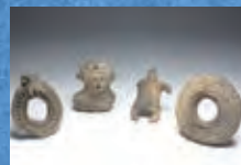
(iv) Irie and Takasago Shell Midden (Toyako Town)