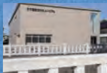
(iii) Date City Museum of History and Culture (Date City)