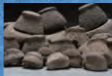
(ii) Kitakogane Shell Midden (Date City)