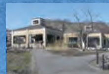
(v) Toyako Visitor Center / Volcano Science Museum (vi) Disaster Monuments at Konpira Craters (Toyako Town)