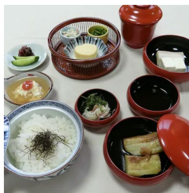
An example of Shojin Cuisine