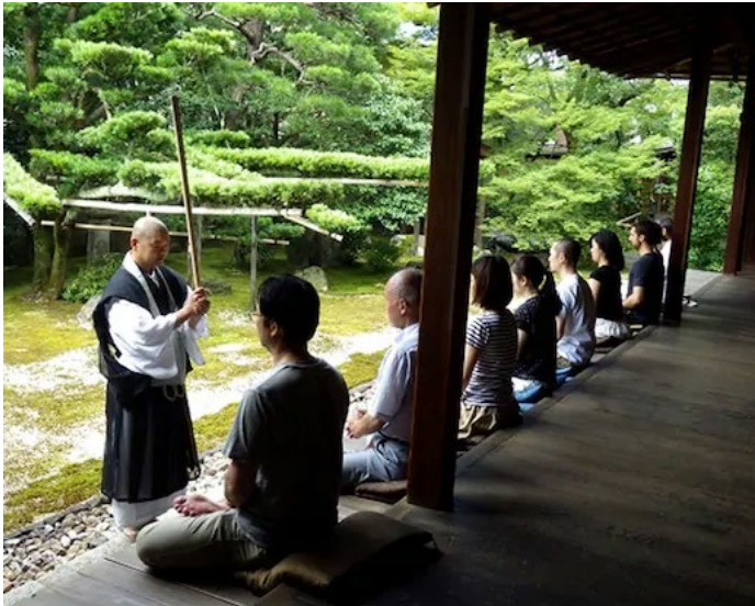
Zazen Seated Meditation

In this special experience available only to ICOM Kyoto participants, you'll be able to join the Buddhist practice of zazen – seated meditation within a temple hall. We will travel to the Daitoku-ji Temple and spend the morning at Daiji-in, which is usually not open to the public – experiencing a variety of activities relating to the temple. We'll enjoy a special breakfast, carefully prepared in line with the tradition of shojin ryori , Zen Buddhist vegetarian cuisine. As this trip ends at the Kyoto International Conference Center, you'll be able to go straight into the first session of the morning. It's a great opportunity to start the day refreshed inside and out!